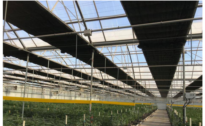
Darkening of Cannabis

The screen is easy to combine with a second screen, thus creating a triple layer darkening effect.